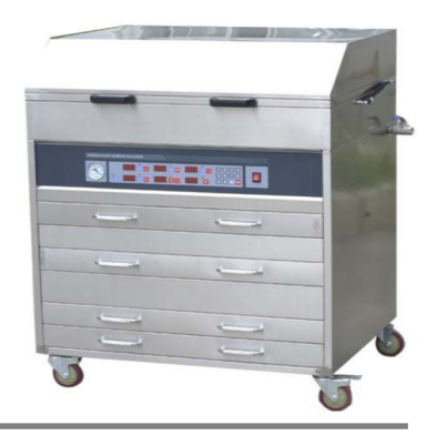
Plate Cutting Equipment

Produce commercial quality plates in minutes with the McLantis FlexoMac 3 in 1 Plate Making Unit. This self contained unit can expose, washout and dry a finished plate in under 30 minutes. Complete with highly accurate digital timers, means perfect plates every time.